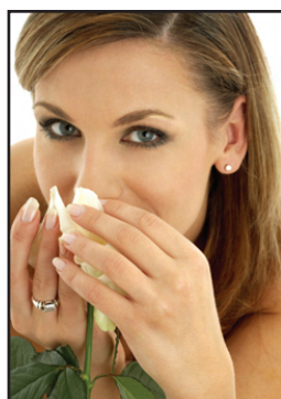
Healthy Lifestyles for the Bride To Be Page 15