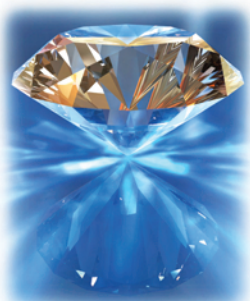
A Diamond's Secrets Page 8