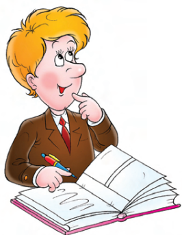
Grooms Planning Checklist Page 4