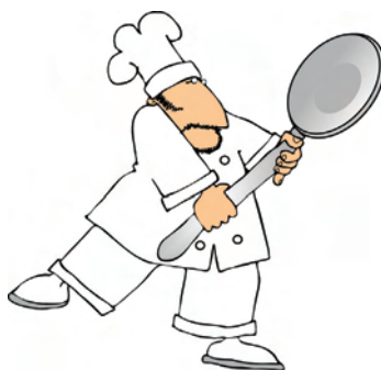
Let Them Eat Cakes Page 20